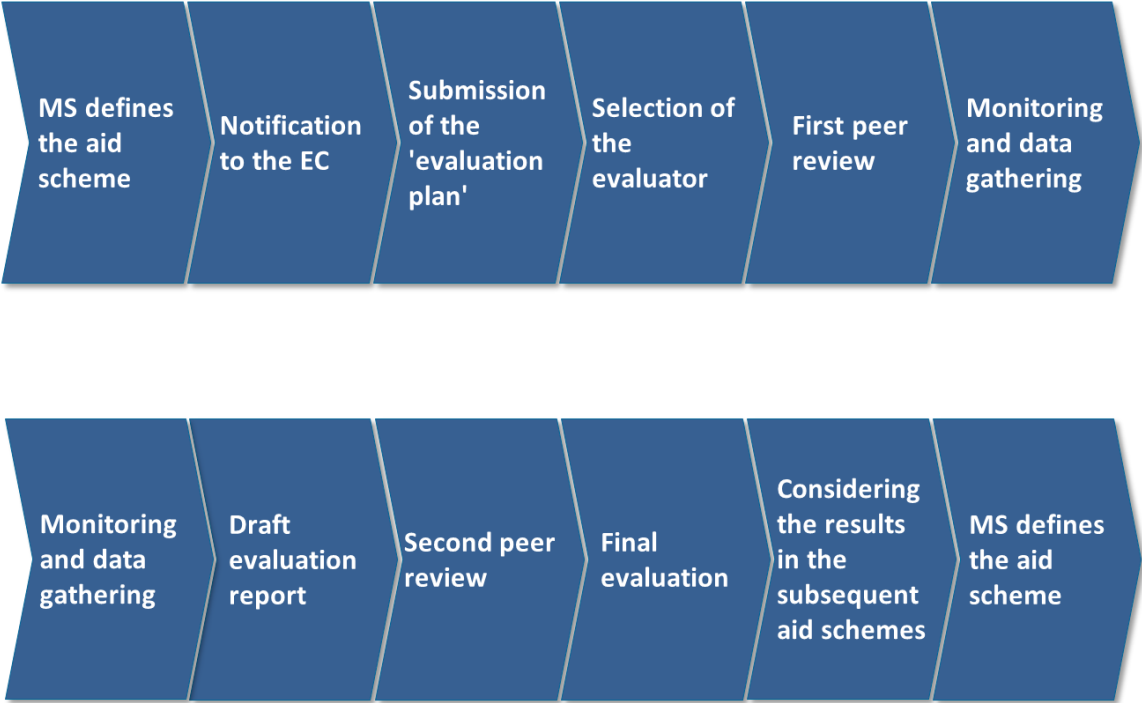
Figure 3 – Overview on the process of evaluation

The aim of establishing such peer review is to obtain an expert report assessing the overall soundness of the evaluation (and not doing a separate evaluation instead), as well as to highlight its potential shortcomings. The identity or the selection principles of the peer-reviewers as well as their exact tasks would then have to be described in the evaluation plan.